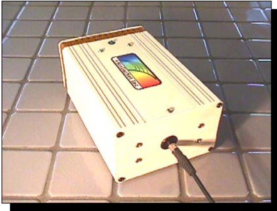
Worlds smallest 4000 hour deuterium light source for CW (continuous wave) UltraViolet for the 190-450nm range.