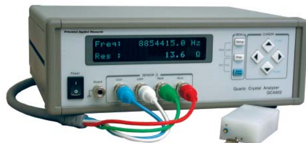
QCM922 Main Body, Cable, and Au Resonator

Princeton Applied Research is proud to offer the QCM922 Quartz Crystal Microbalance. The QCM922, an instrument developed for piezoelectric gravimetry in the ng- \mu g regions, monitors both the resonant frequency and resonant resistance of a Pt or Au coated AT-cut quartz crystal. The resonant frequency changes with the effective surface mass on the crystal, and the resonant resistance changes with the viscosity of the material interfacing with the surface of the quartz crystal. Capable of covering a wide range of applications, the QCM922 was developed primarily for applications where it is used in conjunction with a potentiostat/galvanostat as an Electrochemical Quartz Crystal Microbalance (EQCM).